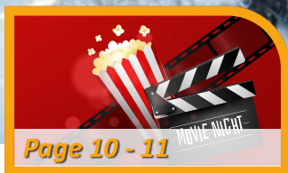
Page 10 - 11