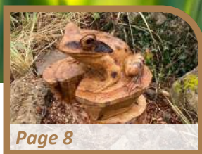
Open Spaces Update